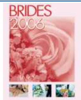
2006 Bridal Guide