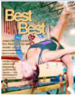
2006 Best of the Best