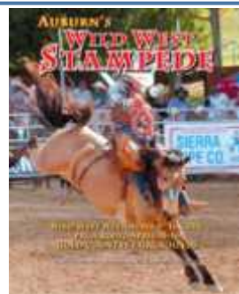
2006 Auburn Stampede